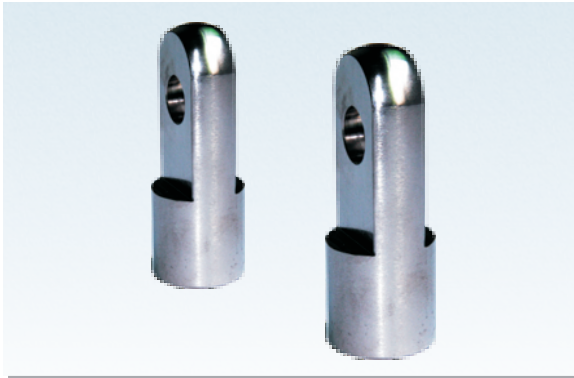
■ Table for I knuckle and cylinder