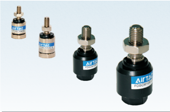
Table for floating joint and cylinder